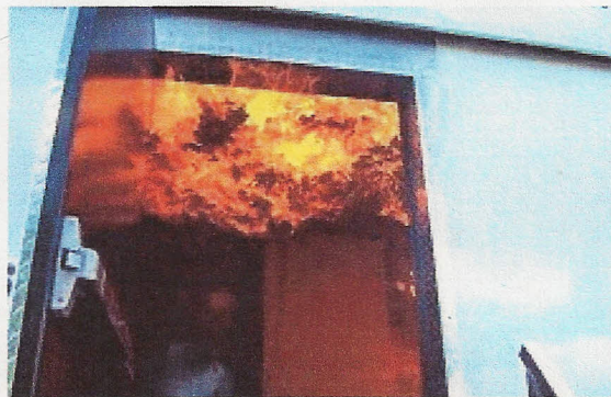
This training system is the first in Santa Cruz County and will be used to help save lives.

The Rio Rico Fire District recently received a state-of-the-art firefighter training simulator developed by Fireblast 451 Inc. This training system is the first in Santa Cruz County, and will be used to help save lives, by providing live fire training and hands-on tactical experience in a safe and controlled environment.