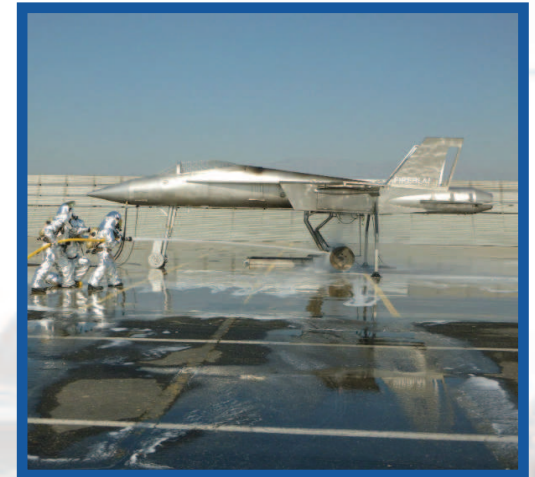
SPILL FIRE ATTACK