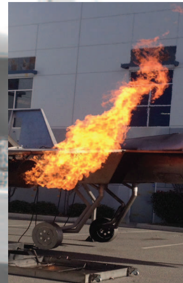
WING ENGINE FIRE